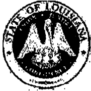
John Bel Edwards GOVERNOR