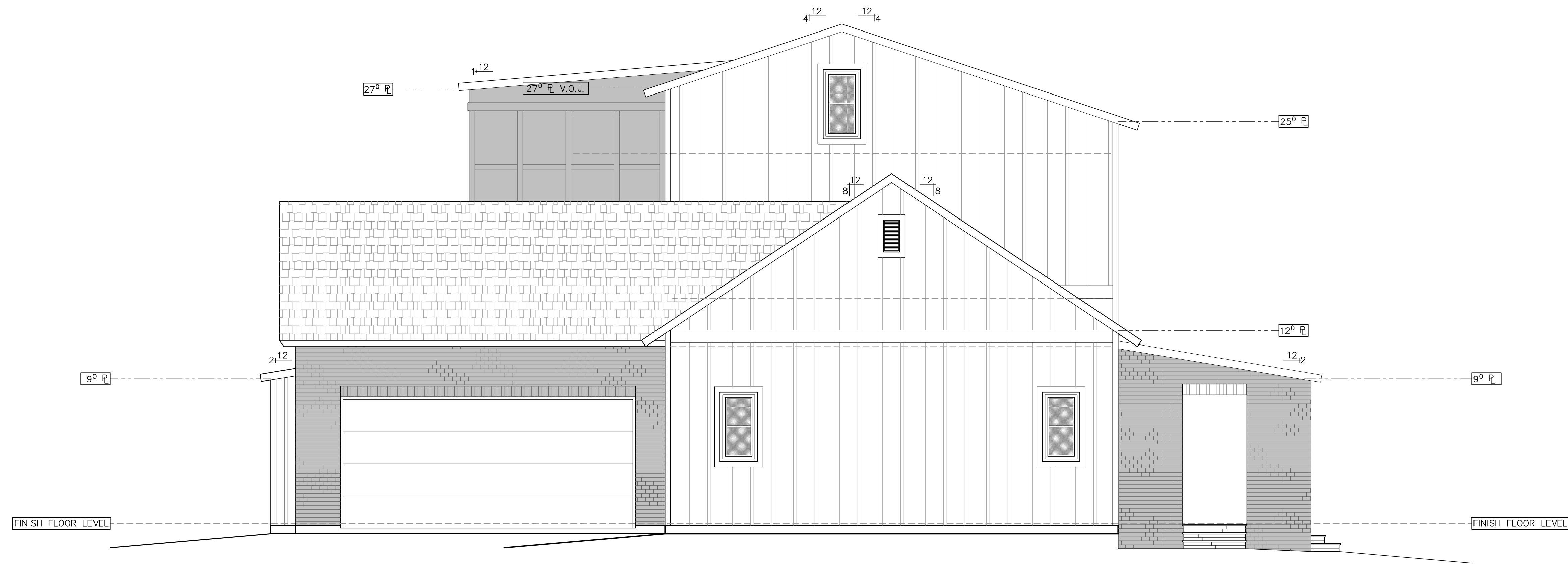
Right Side Elevation 1/4" = 1'