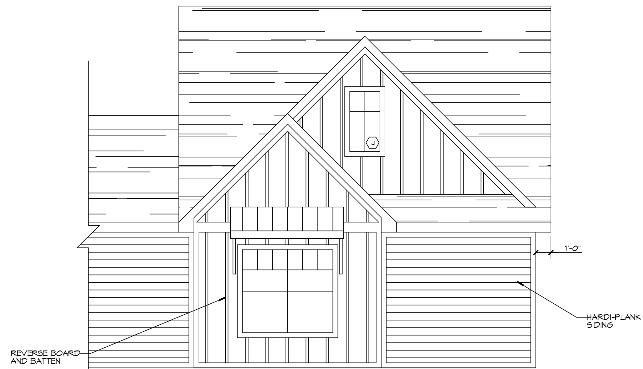
8 FRONT ELEVATION SCALE: 1/4"=1'-0"

FILE NAME: J:\-RESIDENTIAL\Garage\Garage.dwg DATE: 06-04-2022 10:55:25