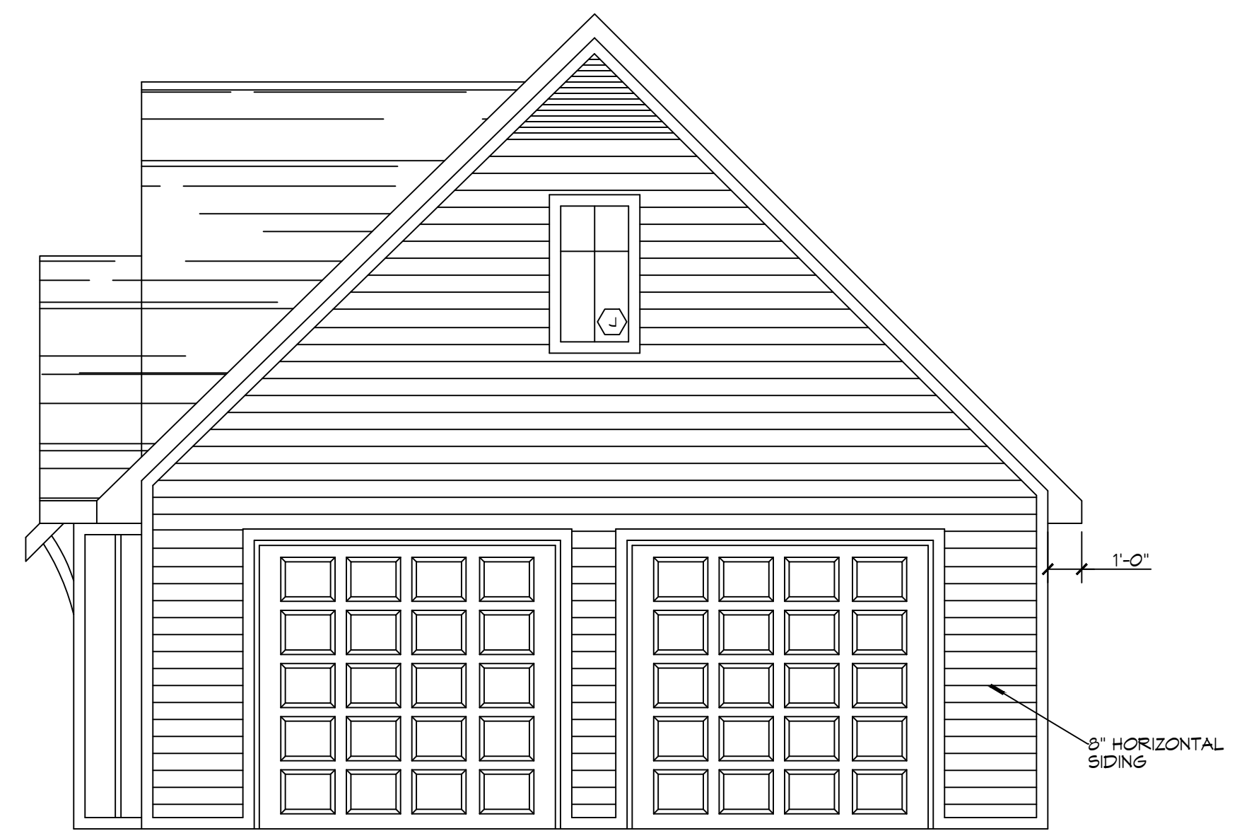
9 SIDE ELEVATION SCALE: 1/4"=1'-0"