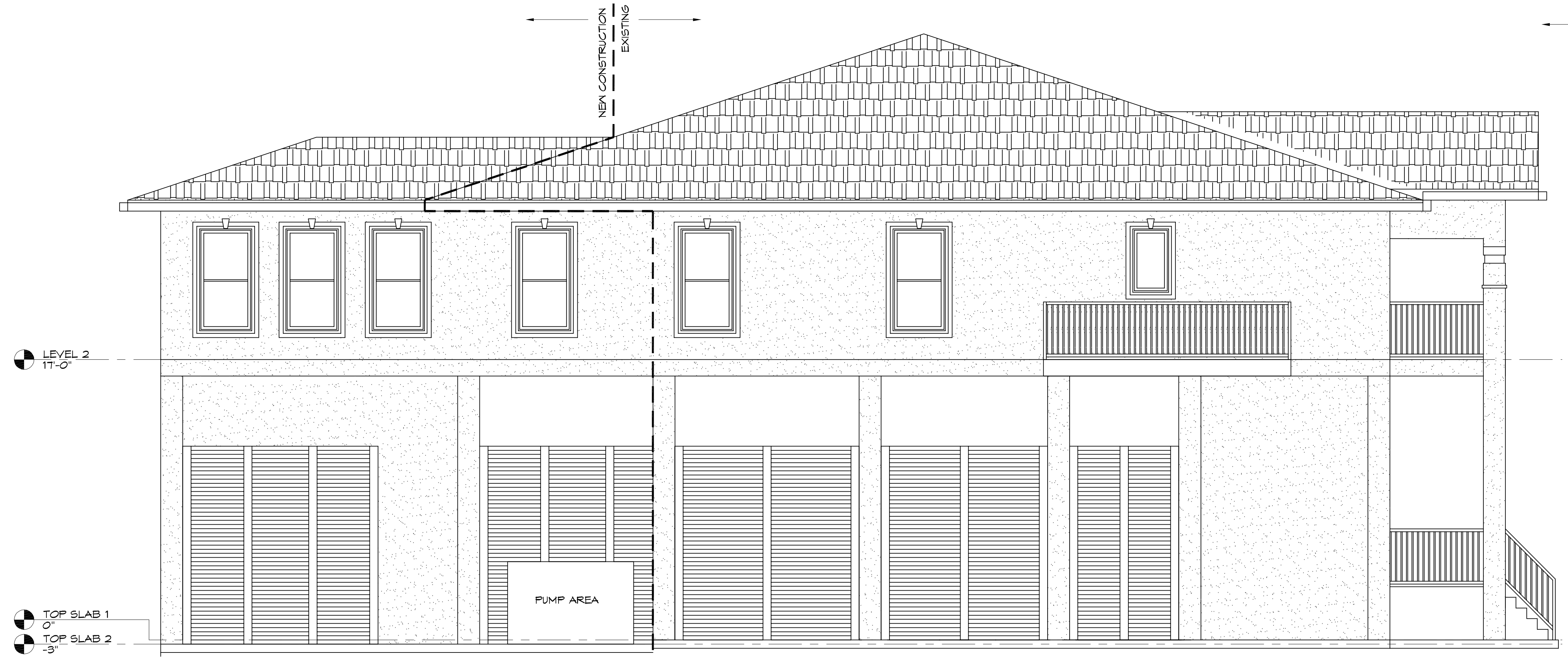
3 LEFT SIDE ELEVATION SCALE: 1/4" = 1'-0"

DAMMON ENGINEERING, INC. www.dammonengineering.com info@dammonengineering.com 1544 Old Spanish Trail Slidell, LA 70458 PH: 985.649.8832 Fax: 985.641.5950