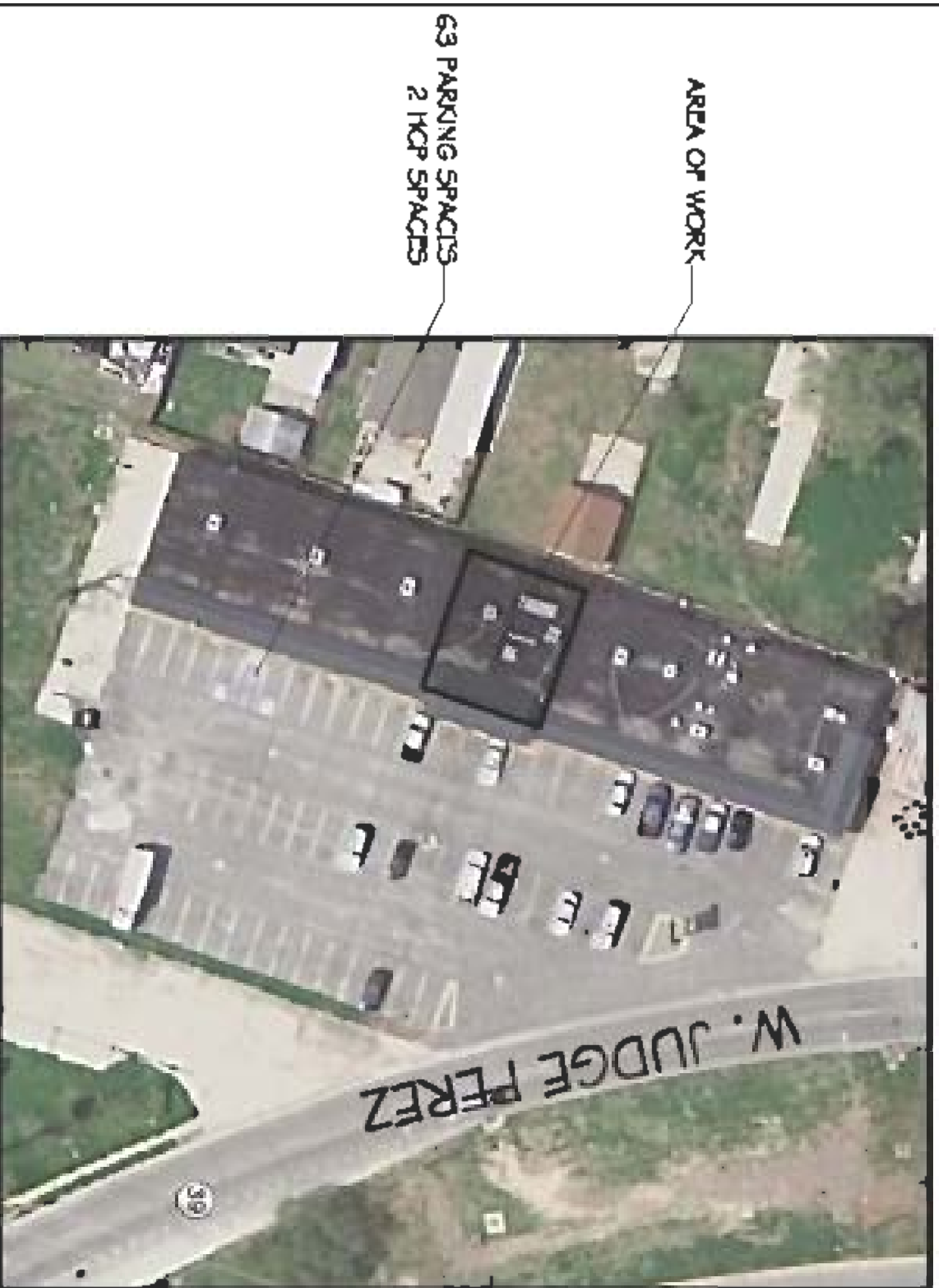
SITE PLAN N.T.S.