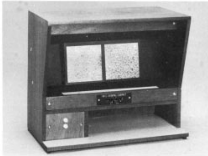
FIG. 2 Apparatus for Fabric Evaluation

with comparison being based on testing specimens randomly drawn from one sample of material of the type being evaluated. Competent statistical assistance is recommended for the investigation of bias. A minimum of two parties should take a group of test specimens, which are as homogeneous as possible and which are from a lot of material of the type in question. The test specimens then should be assigned randomly in equal numbers to each laboratory for testing. The average test results from the two laboratories should be compared using an acceptable statistical protocol and probability level chosen by the two parties before the testing is started. Appropriate statistical disciplines for comparing data must be used when the purchaser and supplier cannot agree. If a bias is found, either its cause must be found and corrected, or the purchaser and the supplier must agree to interpret future results with consideration for the known bias.