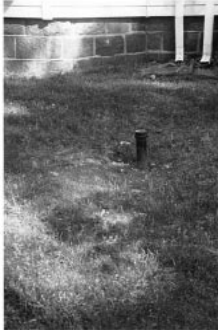
NOTE 1—Approximately 2½-in. (64-mm) diameter with screw cap. FIG. X2.9 Fill Pipe for Residential Underground Fuel Oil Storage Tank