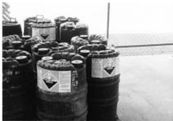
FIG. X2.2 Chemical Storage in 55-gal (208-L) Plastic Drums