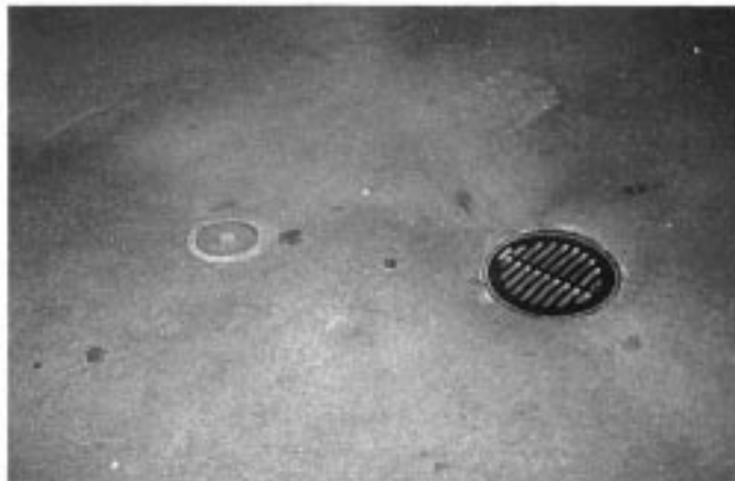
FIG. X2.5 Example of Floor Drain

NOTE 1—Floor drains come in various shapes and sizes. Shown here is one type of floor drain. It is important to know the point of discharge of any floor drain.