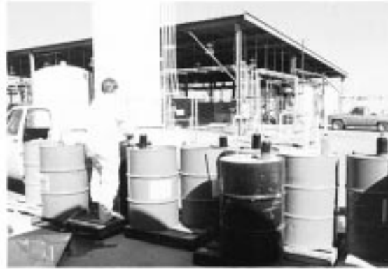
FIG. X2.1 Chemical Storage in 55-gal (208-L) Steel Drums