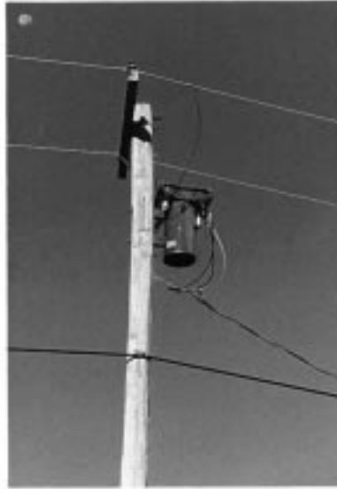
FIG. X2.3 Typical Pole-Mounted Transformer