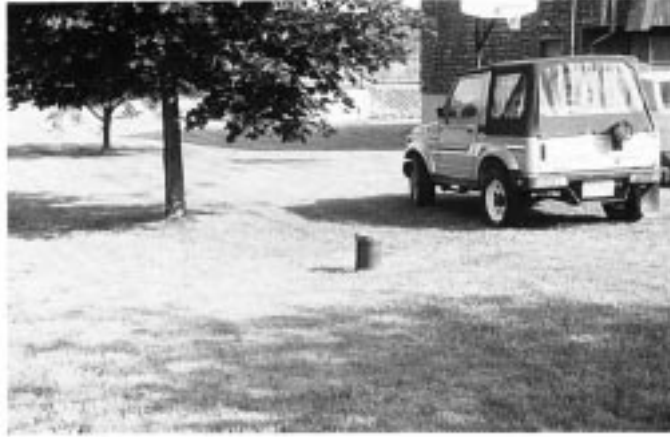
NOTE 1—Approximately 8-in. (203-mm) diameter FIG. X2.11 Water Supply Well for Residential Property