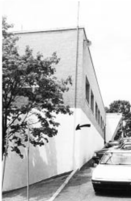
FIG. X2.8 Single Tall Vent Pipe (Arrow) for Underground Storage Tank on Side of Building