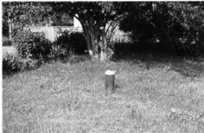
NOTE 1—Approximately 8-in. (203-mm) diameter. FIG. X2.10 Water Supply Well for Residential Property