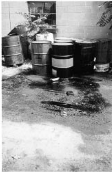
FIG. X2.12 Surface Staining from Improper Drum Storage