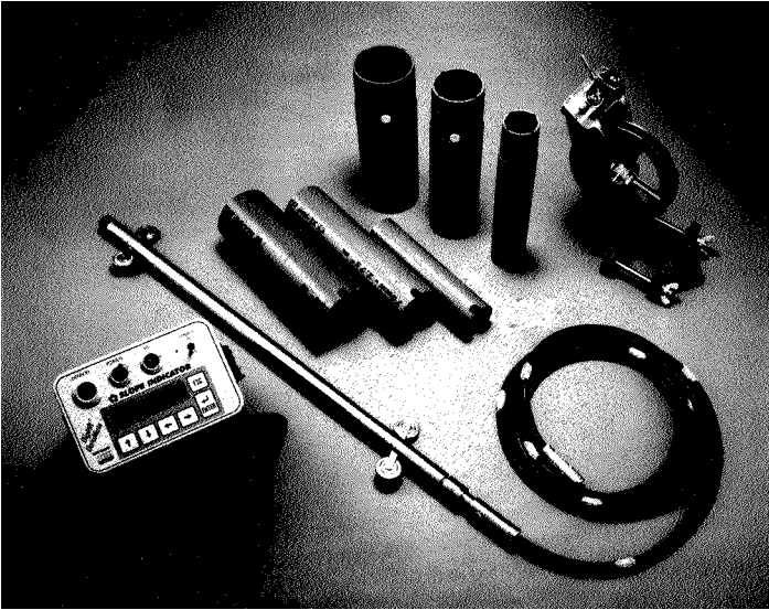
FIG. 1 Typical Components of Inclinometer System

prevent spiraling of the casing grooves. Twist adjacent couplings in alternate directions before fixing to minimize spiraling. Examine the casing during assembly to confirm that spiraling is not occurring. Place a cap on the bottom end and seal it to prevent inflow.