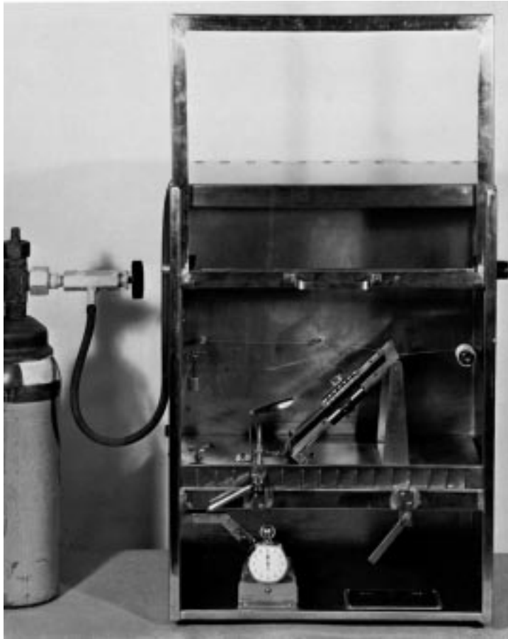
FIG. 1 Flammability Tester