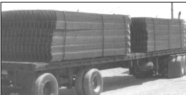
WWR Sheet bundles in route for delivery.

If the rolls or sheets must be lifted by crane at the job site, the customer may request the WWR manufacturer to install lifting eyes.