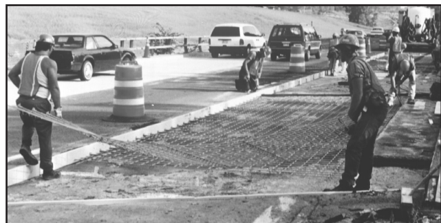
6x6 - W10 x W10 WWR used in bridge redecking. - Albany, NY

When two layers are specified (usually over 8" thick), the top cover will be 1" to 2" depending on saw cuts