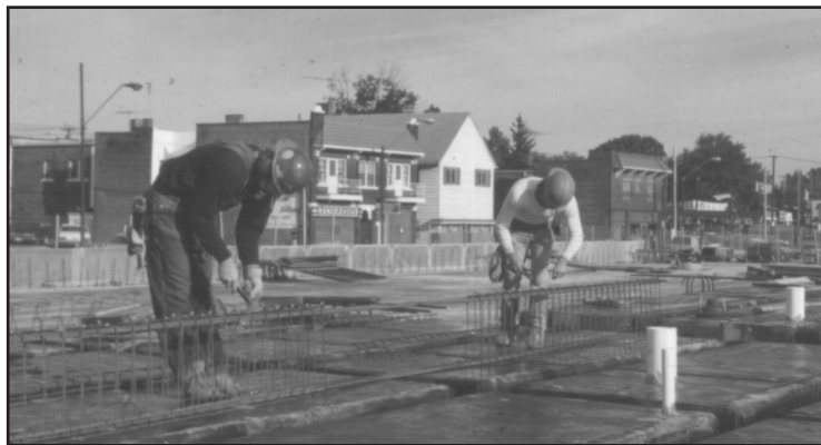
A skip pan joist and slab floor system with high strength WWR.