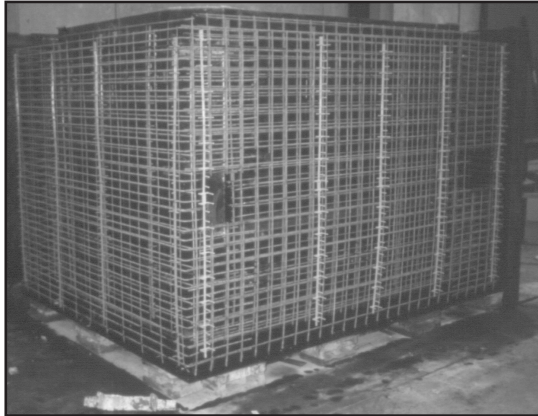
Structural WWR used in box culverts.