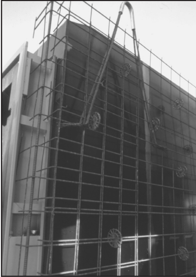
Wall reinforcing used for precast correctional cells - Adult Detention Center, Fairfax County, VA

WWR's strength, flexibility and other advantages have long been relied upon by the precast industry, particularly for applications that may be subjected to high flexure and shear stresses. In recent years, with advances in assessment and manufacturing technologies, WWR's use in a broader base of structural applications is growing rapidly.