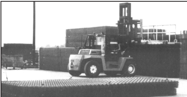
WWR Sheet being loaded for truck shipping.

Sheets are bundled in quantities depending on size and weight of sheets and in accordance with the customer's requirements. Generally, bundles of rolls or sheets will weigh between 2000 and 6000 pounds. Banding is used for shipping stability only. Bundles should never be lifted by the steel banding.