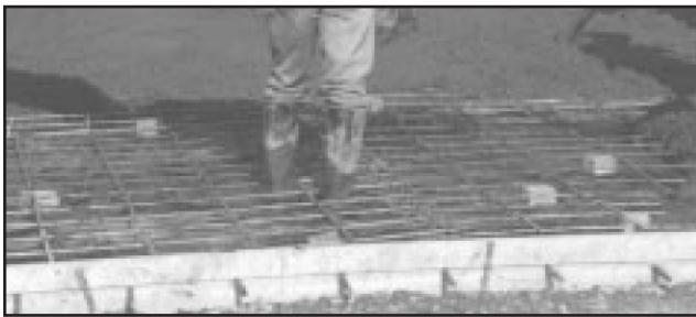
Wide spaced 12x12 - D7xD7 WWR for slab on grade construction to obtain proper positioning in this auto parts distribution facility in Zanesville, OH.

Light WWR styles - W4 or D4 or less: . . . 2'-3' or less**