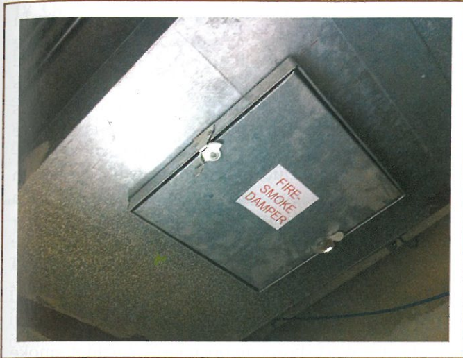
Exhibit 18/19.88 Smoke barrier duct penetration protected by smoke damper.