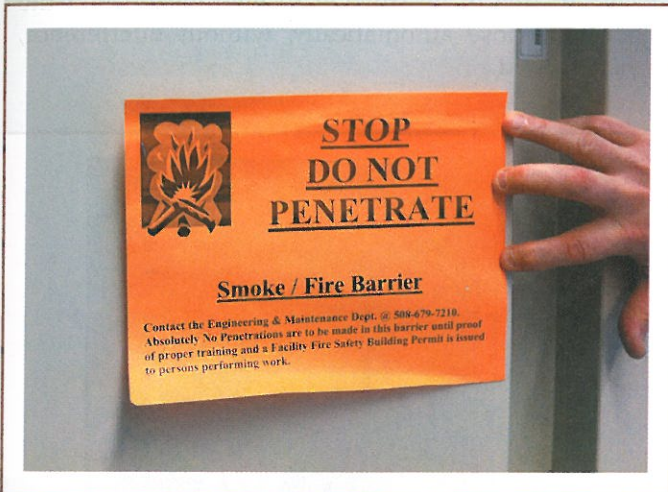
Exhibit 18/19.89 Placard with warning against penetration of smoke barrier.

permitted if an engineered smoke control system required a damper at this point. Openings for transfer grilles require automatic-closing dampers.