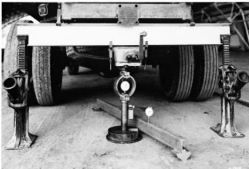
FIG. 1 Setup for Field In-Place Tests

5.1 Prepare the general surface area to be tested by removing from the surface loose and dried material which is not representative of the soil to be tested. Produce a test area which