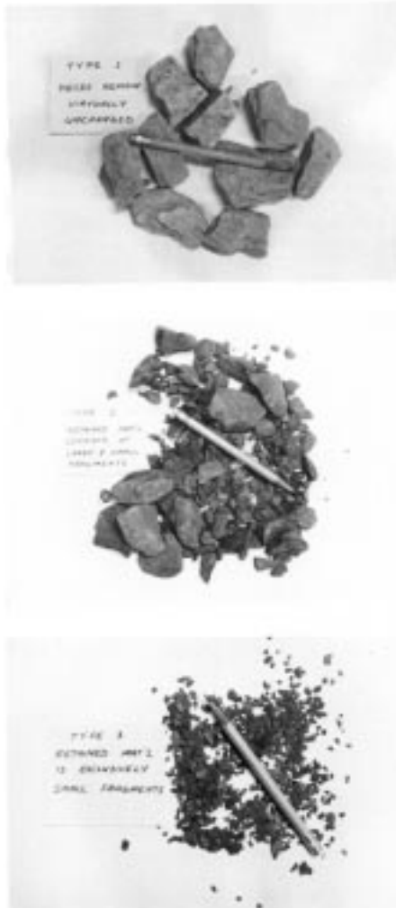
FIG. 2 Illustration of Fragment Types Retained