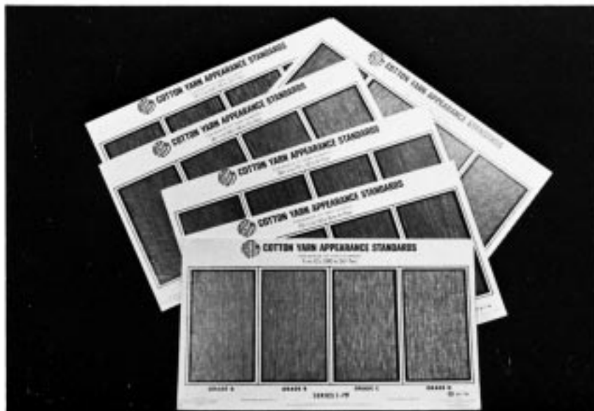
FIG. 1 ASTM Spun Yarn Appearance Standards