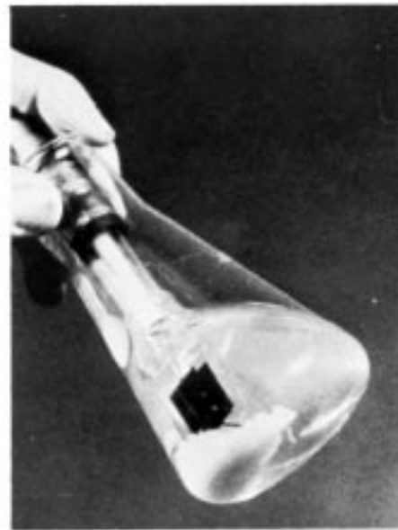
FIG. 2 Dip Cell Immersed in Flask

14.5.1 Place a resin sample weighing 2.00 \pm 0.01 \text{ g} in a 250-mL Erlenmeyer flask that has previously been rinsed twice with boiling, high-purity water. Add 5.0 \pm 0.5 \text{ mL} of isopropyl alcohol to the sample, and swirl the mixture until the resin is uniformly wet. Add 100 \pm 1 \text{ mL} of boiling, high-purity water, set a watch glass on top of the flask, and boil gently for 5 min. Cool rapidly to 23 \pm 1^\circ\text{C} . Allow the resin to settle, and then place the dip cell in the flask so that the electrodes are completely immersed, as shown in Fig. 2. Measure the resis-