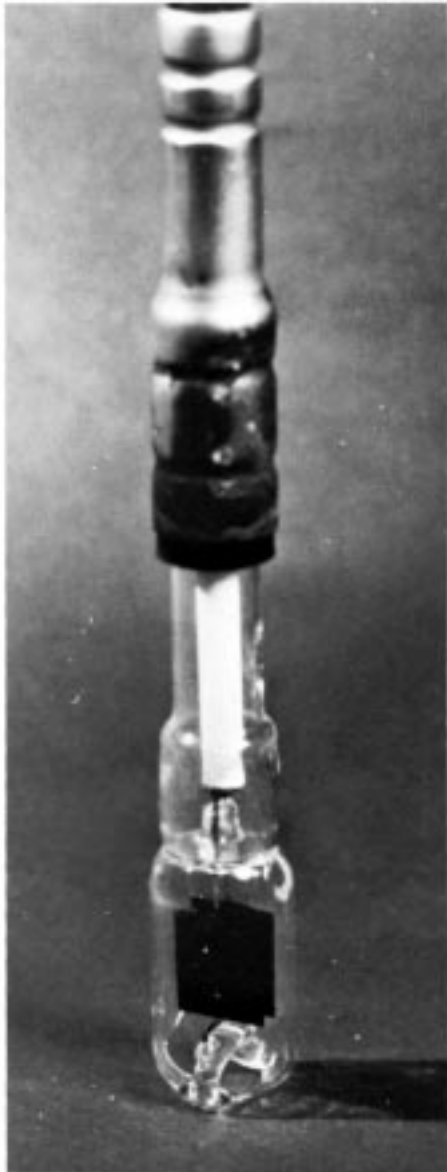
FIG. 1 Dip Cell for Electrical Conductivity Test

14.3.2 Dip Cell , 13 having platinum electrodes and a cell constant of about 0.1 \text{ cm}^{-1} , similar to the one shown in Fig. 1.