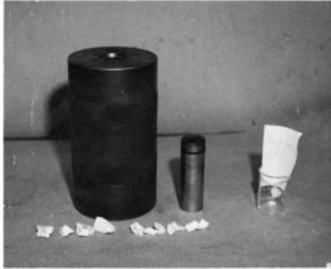
FIG. 2 A Typical Unassembled Pressure Vessel and Samples