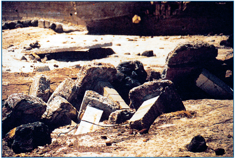
The small footings on the piers in this photograph did not prevent these piers from overturning during Hurricane Iniki.

The combination of high winds and moist (sometimes salt-laden) air can have a damaging effect on masonry construction by forcing moisture into even the smallest of cracks or openings in the masonry joints. The entry of moisture into reinforced masonry construction can lead to corrosion of the reinforcement steel and subsequent cracking and spalling of the masonry. Moisture resistance is highly influenced by the quality of the materials and the quality of the masonry construction at the site.