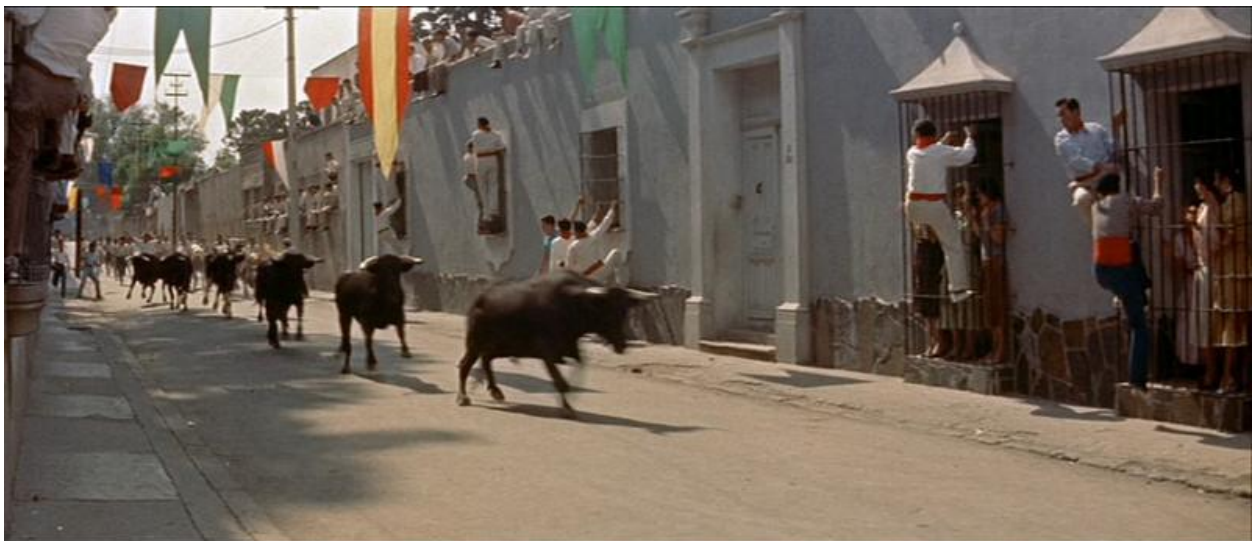
The photo above depicts the running of the bulls from a movie version of TSAR .

War used to be (and to be fair, is still) pictured as a beautiful and glorious event, but that glory became harder to sell citizens after WWI combat, for instance. The literary view of war evolves into the sentimental side (Robin Hood) and those seeking more complicated ways of representing war. You probably noticed last week that most of our authors were fairly negative about modern warfare techniques (including Crane, even if he tells people not to weep – think about how nasty and sad the images he presents are). Most literary works about war, just like literary works about almost any subject, critique war, from the battle itself to the bureaucracy of war to what comes after war. Hemingway, for us, fills this gap. Thus, think about how much this novel is a product of a world that is trying to find itself or settle itself (though with hindsight, we can see that this world will eventually propel itself into WWII before anything gets resolved).