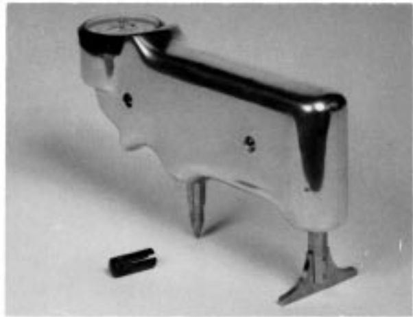
FIG. 1 Barcol Impressor, Model 934-1

5.1 Barcol Impressor, Model 934-1 — See Fig. 1 and Fig. 2.