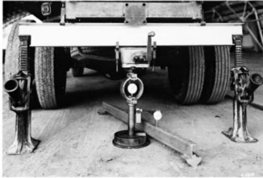
FIG. 1 Setup for Field In-Place Tests