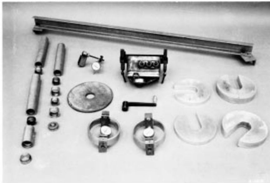
FIG. 2 Apparatus for Field In-Place Tests

5.4 Place the “10-lb” (4.5-kg) surcharge plate beneath the penetration piston so that when the piston is lowered it will pass through the center hole.