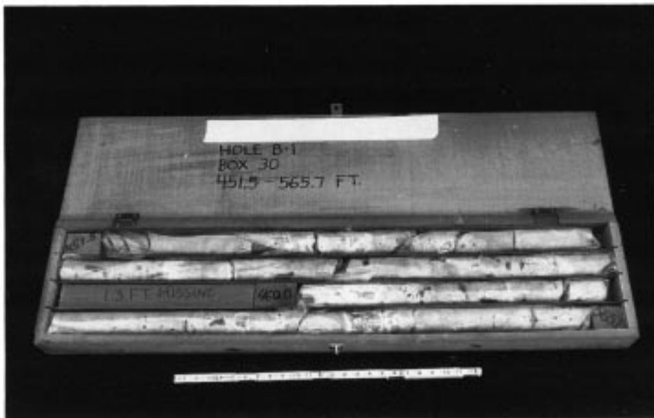
FIG. 2 Typical Wooden Core Box Showing Core Placement, Labeling, and Polyethylene Layflat Tubing Placed Over Core as Suggested for Routine Care (as in 7.5.1)