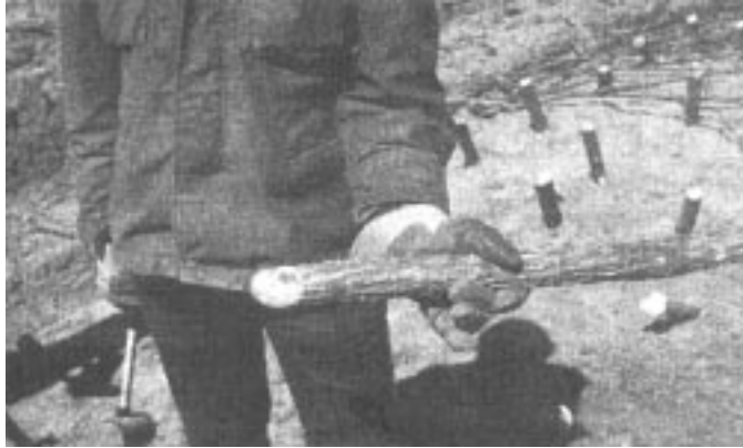
FIG. 1 Individual Live Stake Prior to Installation