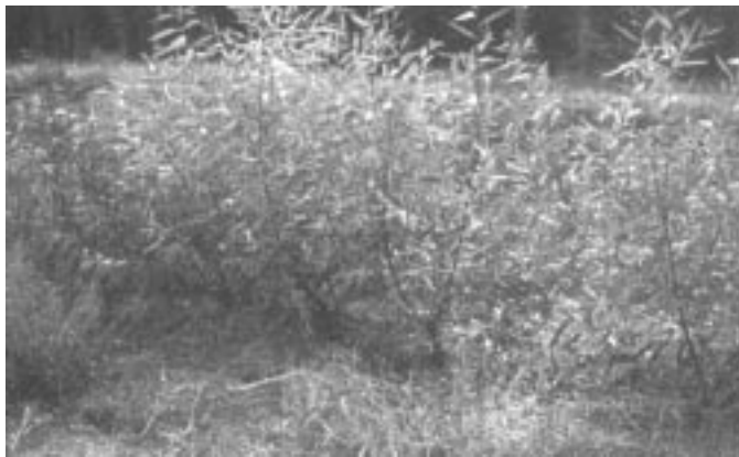
FIG. 3 Photograph of Growing Live Stakes

similar device can be used to make a pilot hole in firm soil. The outside diameter of the iron bar may be no larger than the smallest live stake. Buds are oriented up.