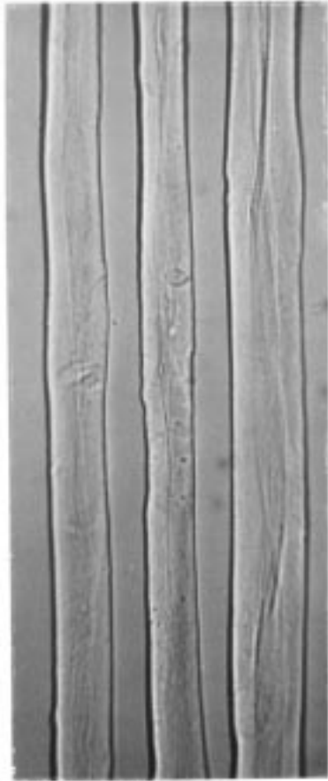
FIG. 3 Mature Fiber

any, between the laboratory of the purchaser and the laboratory of the seller should be determined with comparison based on tested specimens randomly drawn from one sample of material of the type being evaluated.