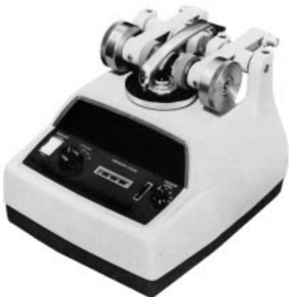
FIG. 1 Rotary Platform Double Head Abraser

6.1.2 The abrasive wheels 6 are either rubber-based or vitrified-based. Both types of wheels are manufactured in