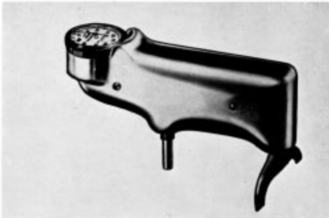
FIG. 1 Barcol Impressor

8.2 Set the point sleeve on the surface to be tested. Set the legs on the same surface or on solid material of the same thickness, so that the indenter is perpendicular to the surface being tested. Grasp the instrument firmly between the legs and point sleeve. Apply quickly, by hand, uniformly increasing force on the case until the dial indication reaches a maximum (Note 3). Take care to avoid sliding or scraping while the indenter is in contact with the surface being tested.