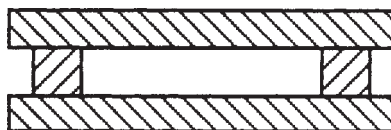
FIG. 1 Flash Picture-Frame Mold

5.3.4 The heating and cooling systems in the mold platens shall be such that, when used with a particular mold, they shall be capable of maintaining a temperature difference between points on the mold surfaces of no more than \pm 5^{\circ}\text{C} during heating or cooling.