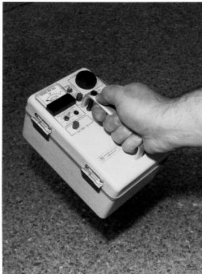
NOTE—Hand-held monitors are computer-based radiation detection systems that operate on battery power. The operator plays an important part in effective hand-held monitoring

5.1 Hand-Held Monitors —These small, battery-powered, computer-operated instruments (Fig. 1) measure ambient background intensity (over 8 s or so) and then calculate an alarm threshold on power-up or push-button command. Otherwise, they continuously monitor, making short measurements (0.05 s long averaged over 0.4 s, for example) and then comparing the results to the alarm threshold. Hand-held monitor detectors may be gamma-ray sensitive NaI(Tl) detectors or, more commonly, plastic scintillation detectors that sense both gamma