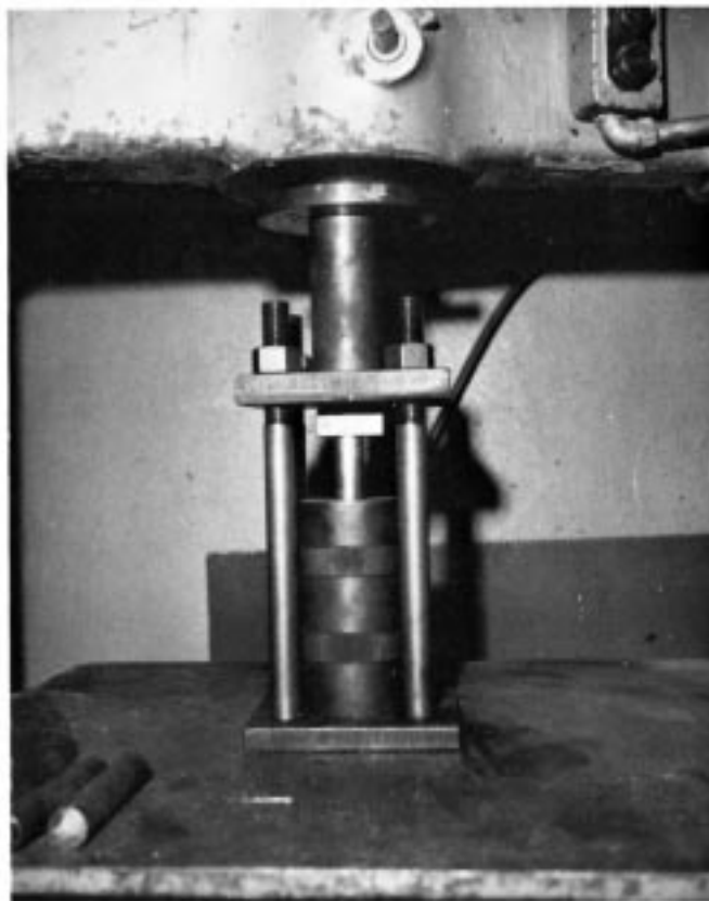
FIG. 3 A Typical Assembled Pressure Vessel

The American Society for Testing and Materials takes no position respecting the validity of any patent rights asserted in connection with any item mentioned in this standard. Users of this standard are expressly advised that determination of the validity of any such patent rights, and the risk of infringement of such rights, are entirely their own responsibility.