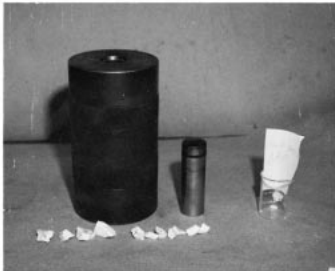
FIG. 2 A Typical Unassembled Pressure Vessel and Samples