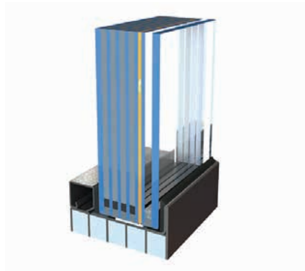
Figure 1: Contraflam fire-rated glass in VDS Framing are key components in Vetrotech HI's make-up.

The resulting combination of framing and glass achieves both the required fire rating and protection desired in HVHZ conditions.