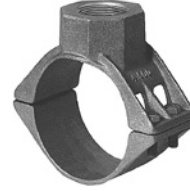
H-13000 Series 2-piece 4"-8" mains; 1/2" or 2" tapping