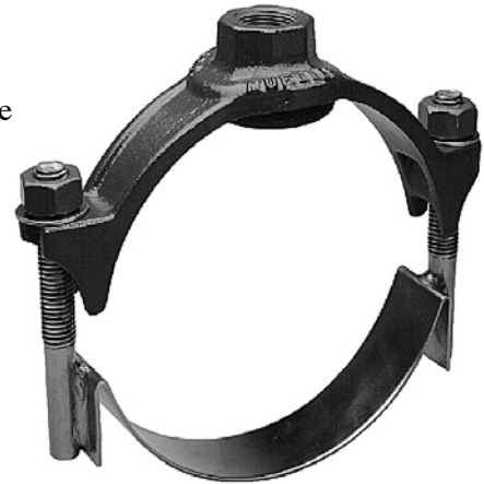
DR 1 S Series