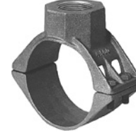
H-13000 Series 2-piece 4"-8" mains; 1-1/2" or 2" tapping