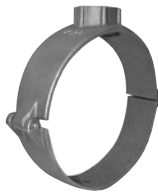
S-13000 Series 2-piece hinged 2" to 8" mains; 3/4" to 1" tapping