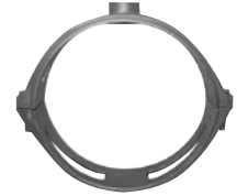
H-13000 Series 2-piece 10" & 12" mains; 3/4" to 2" tapping