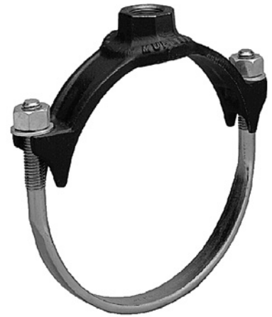
DR 1 A Series