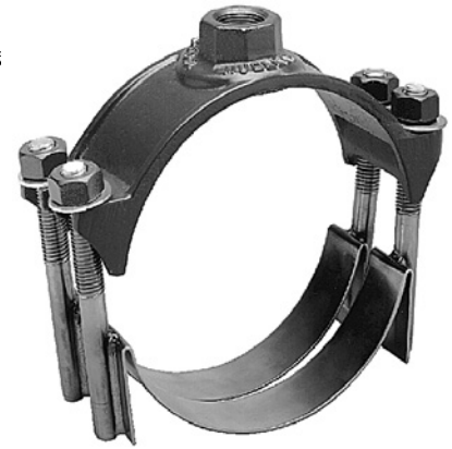
DR 2 S Series