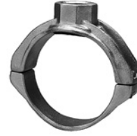
H-13000 Series 2-piece 2" to 8" mains; 3/4" to 1" tapping