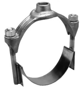
BR 1 S Series