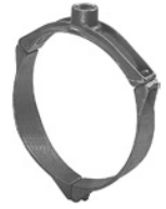
H-13000 Series 3-piece 10" & 12" mains; 3/4" to 1" tapping