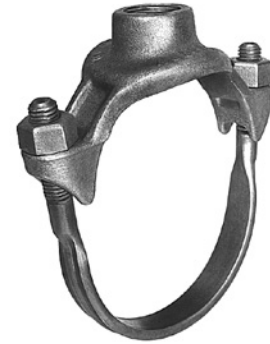
BR 1 B Series