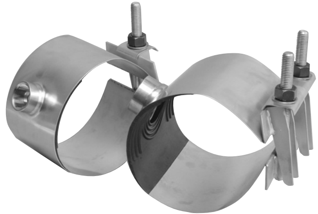
Stainless Steel Service Saddle