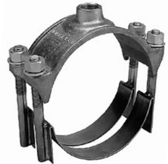
BR 2 S Series BR 2 W Series