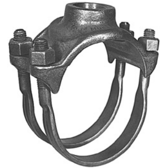
BR 2 B Series