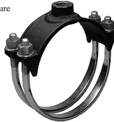
DR 2 A Series