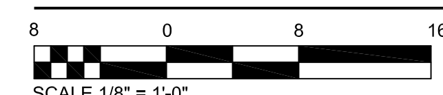
VEHICLE MAINTENANCE (OMS 12) BUILDING FLOOR PLAN - HVAC