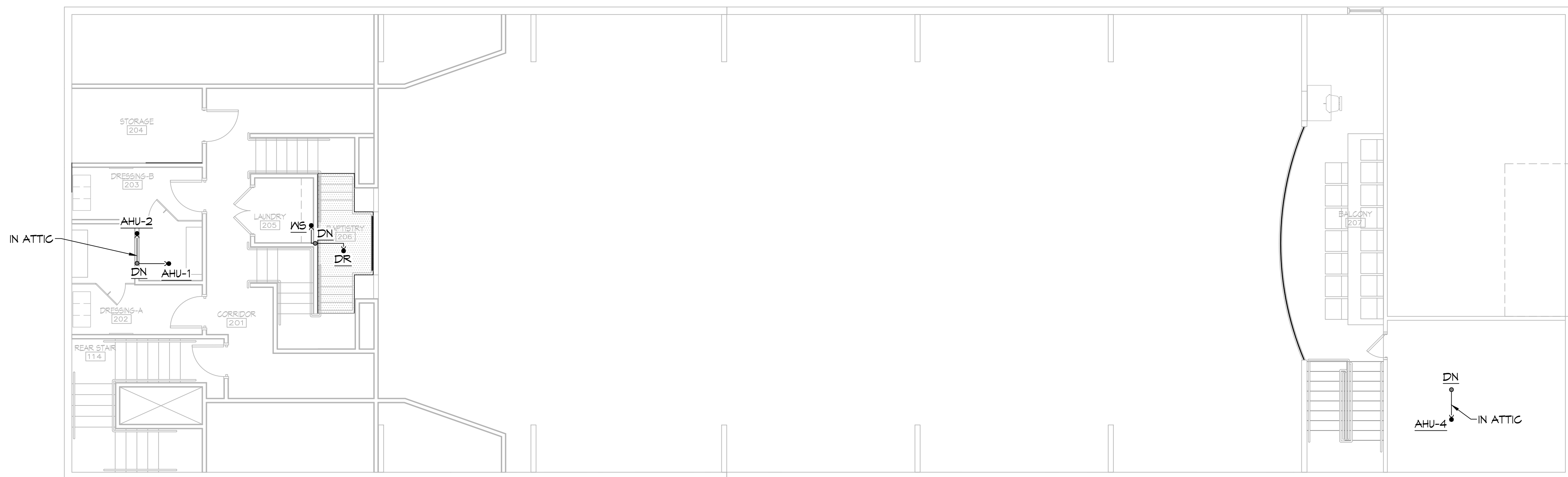
13 SEWER & GAS PLUMBING PLAN SCALE: 3/16"=1'-0"