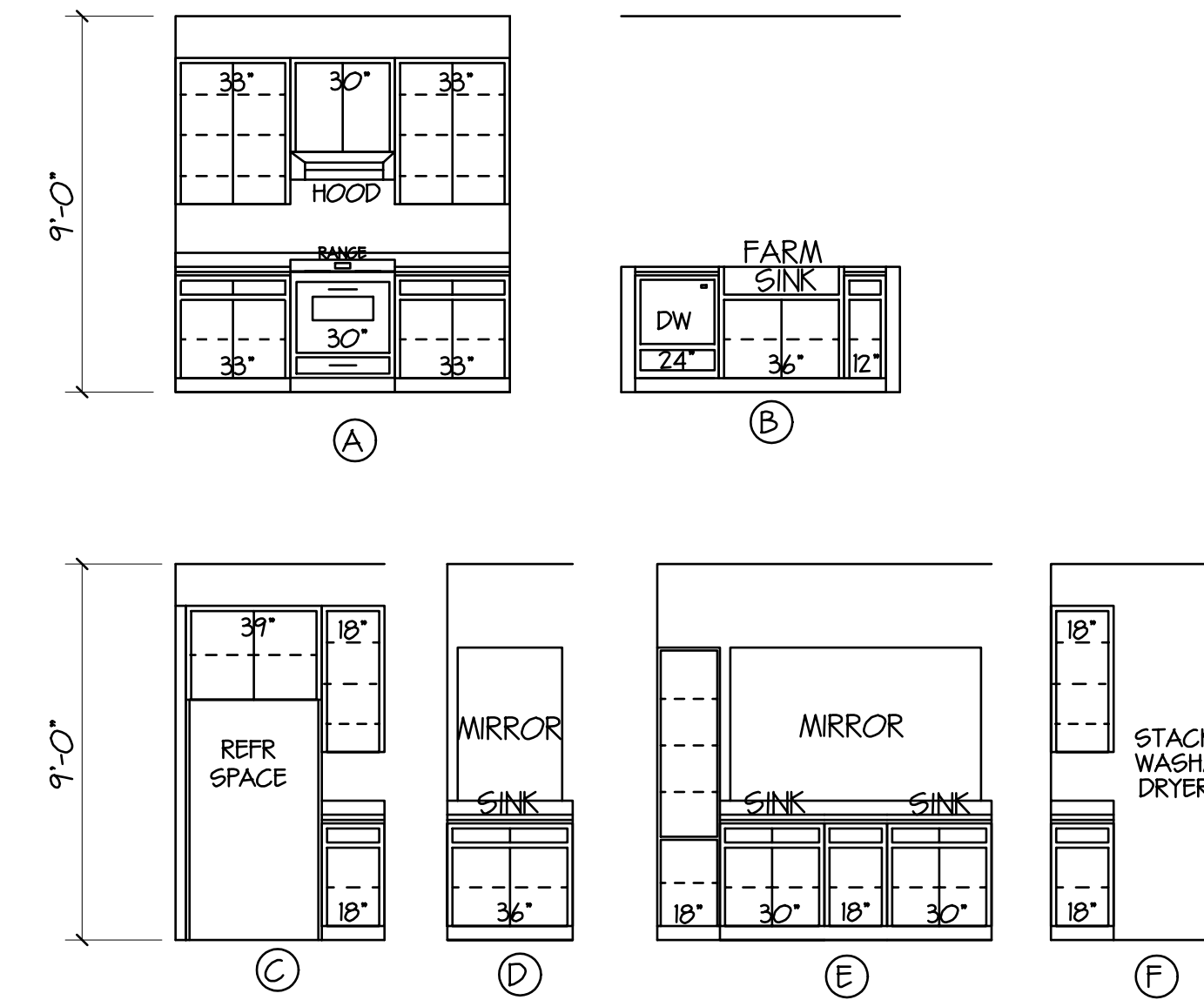
CABINET ELEVATIONS SCALE 1/4"=1'-0"

Although every effort has been made in preparing these plans, the contractor must check all details for accuracy or errors and be responsible for same. Purchaser assumes the risk of any errors, omissions or mistakes during construction due to the fact that DesignTech does not perform field supervision nor select building materials subcontractors and/or products/equipment. All notes, specifications and other information on the plans are included as instructed by and/or with the approval of Purchaser and without warranty of any kind whatsoever. PLANS HAVE BEEN PREPARED FOR USE BY KNOWLEDGEABLE AND EXPERIENCED LICENSED CONTRACTORS. This drawing contains valuable, confidential, proprietary, trade secret information of DesignTech Residential Planners, Inc. No reproduction or other use of the drawing or any of its contents is permitted without consent of DesignTech Residential Planners, Inc.