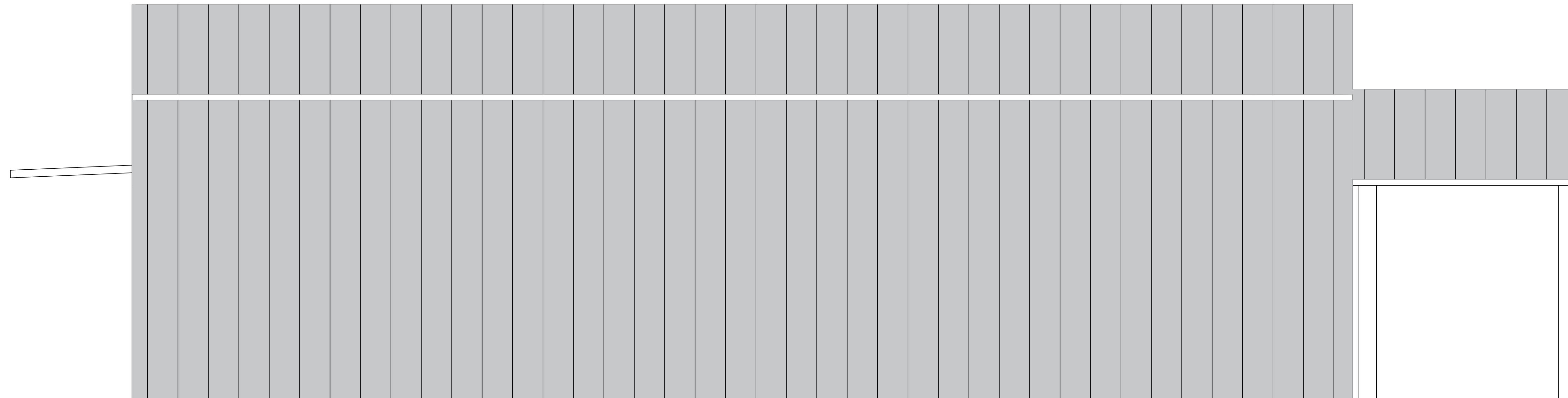
16 NEW WAREHOUSE RIGHT SIDE ELEVATION SCALE: 1/4"=1'-0"