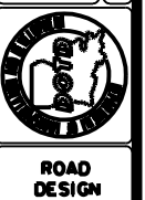
Figure 8-64: Right of Way Map

RIGHT-OF-WAY MAP LA 182 J.C.I.-L.P.-89-E-YEROI SCHOOL ROAD