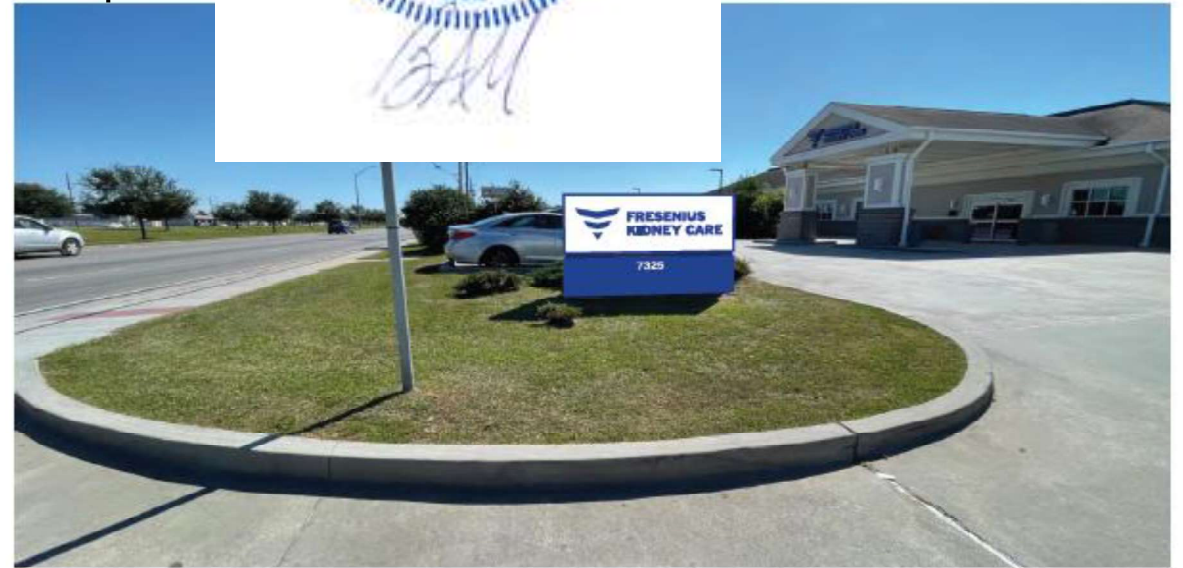
PROPOSED MONUMENT SIGN 42.43 Square feet