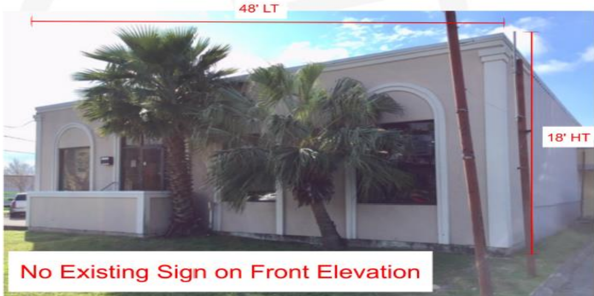
Left Side of Building - 27th St. Elevation