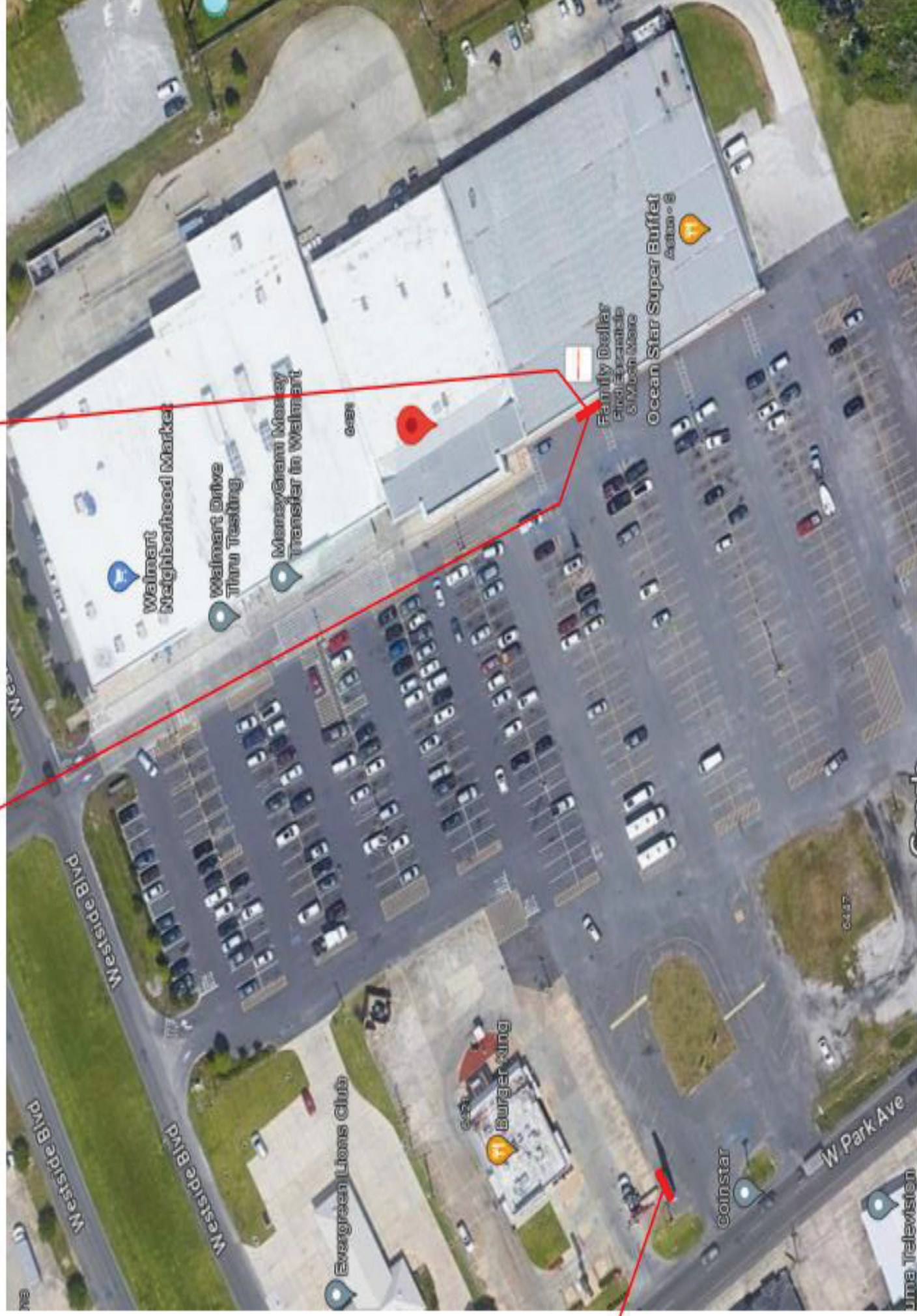
SIGN #2 Window Graphics