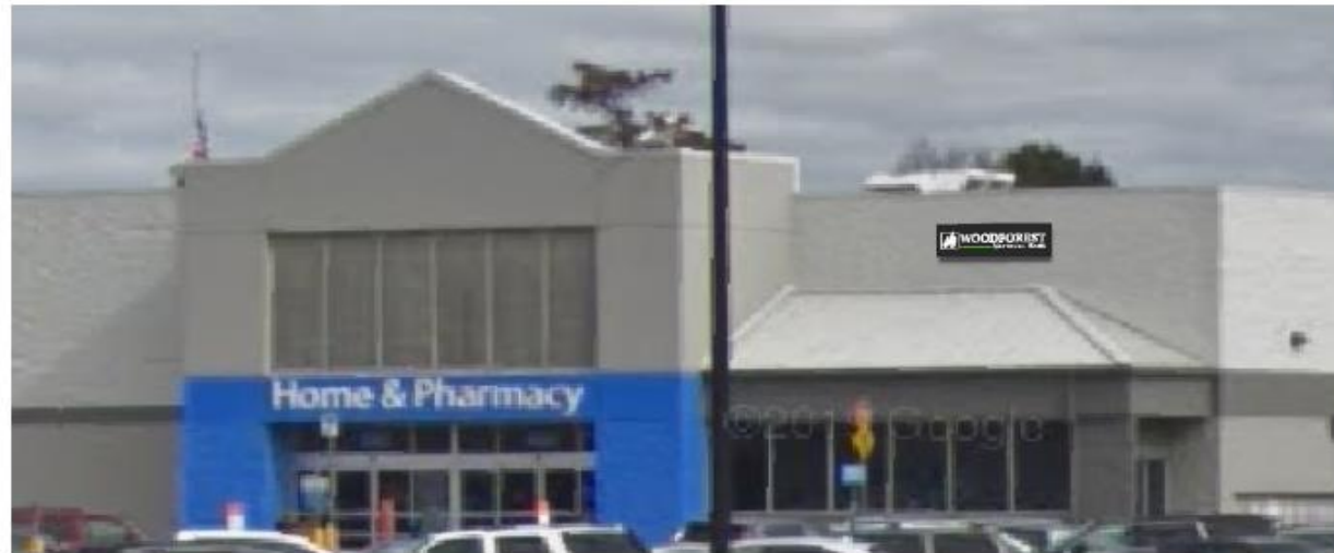
A PROPOSED S/F EXTERIOR WALL SIGN