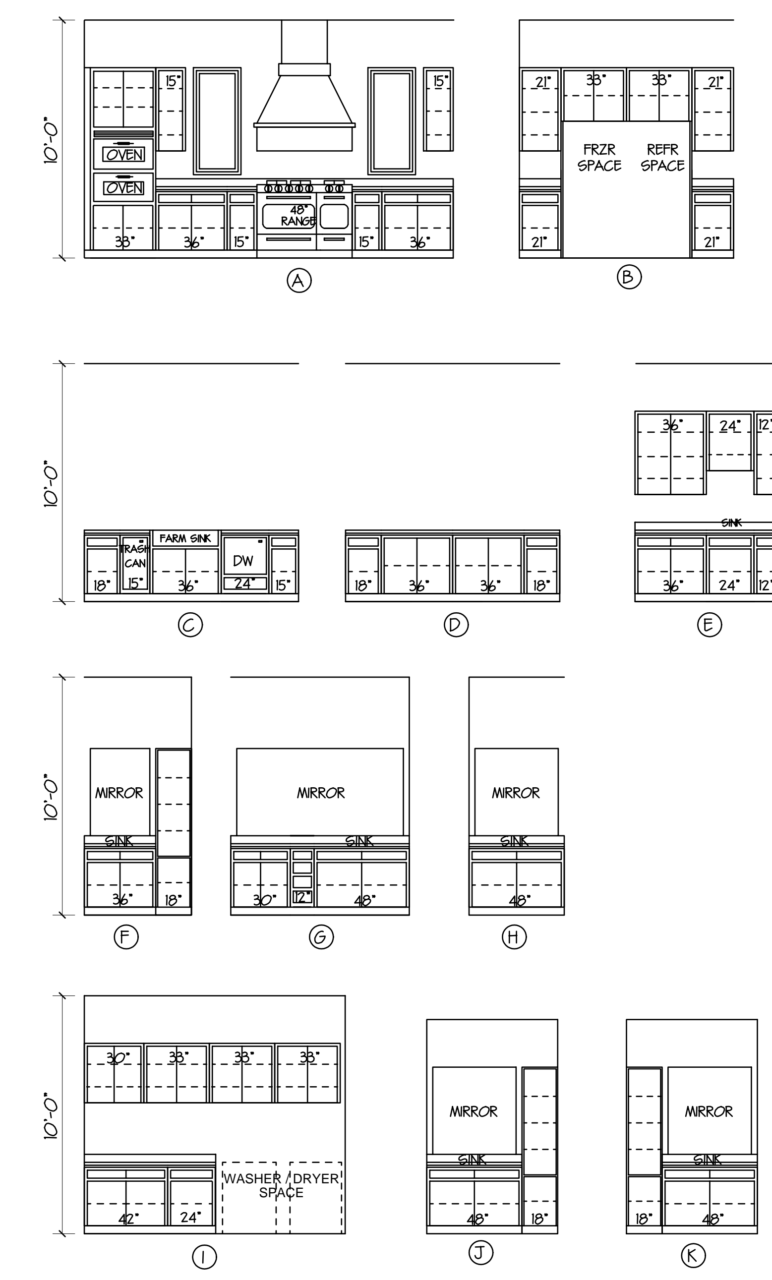
CABINET ELEVATIONS SCALE 1/4" = 1'-0"