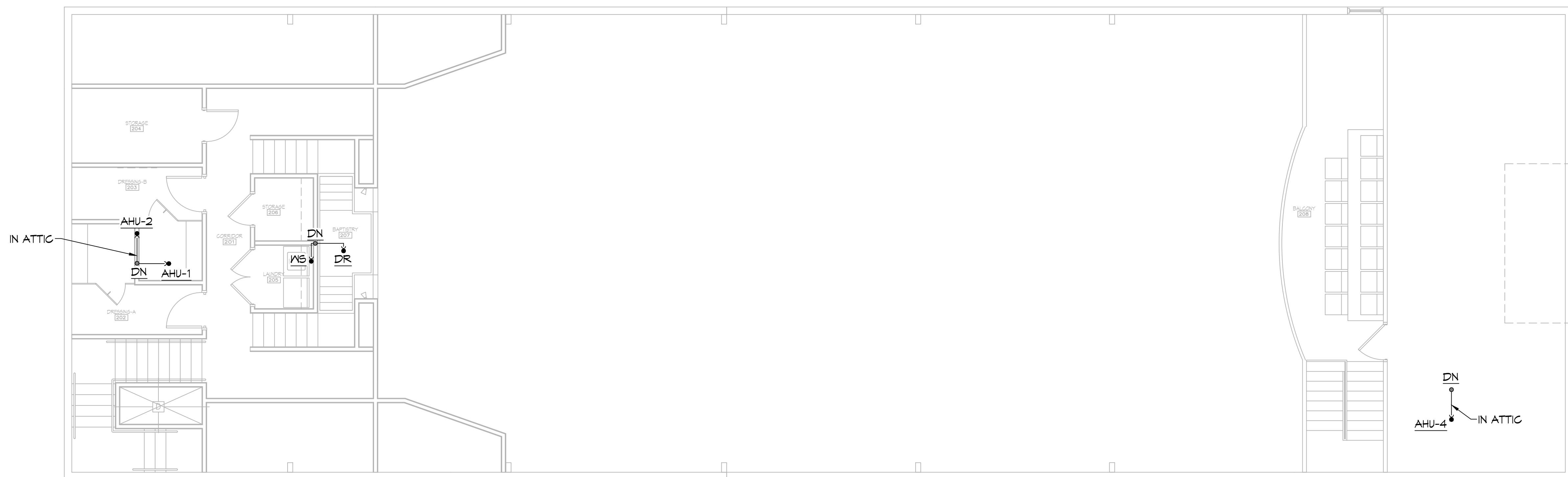
6 SEWER & GAS PLUMBING PLAN SCALE: 3/16"=1'-0"