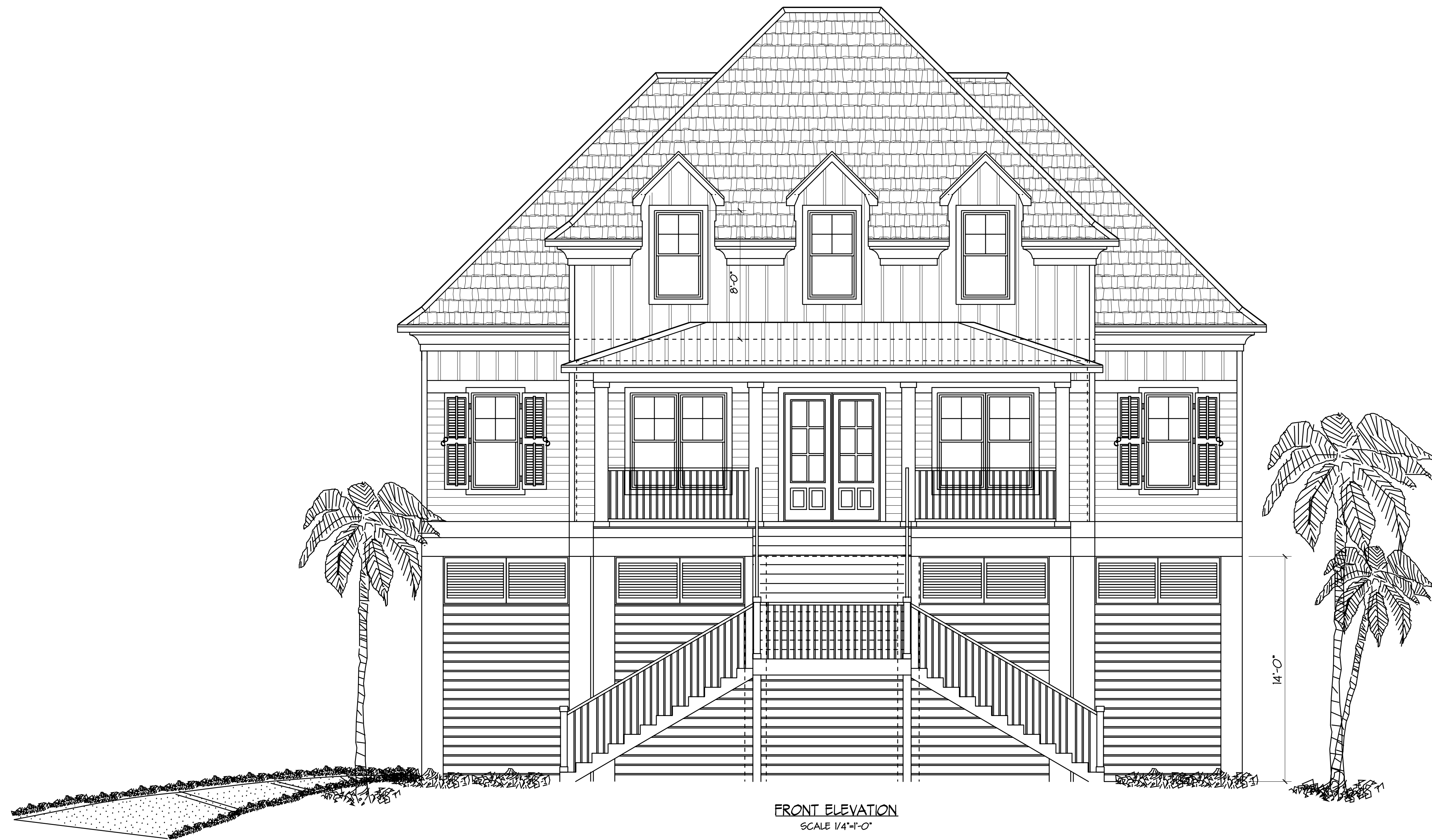
FRONT ELEVATION SCALE 1/4"=1'-0"