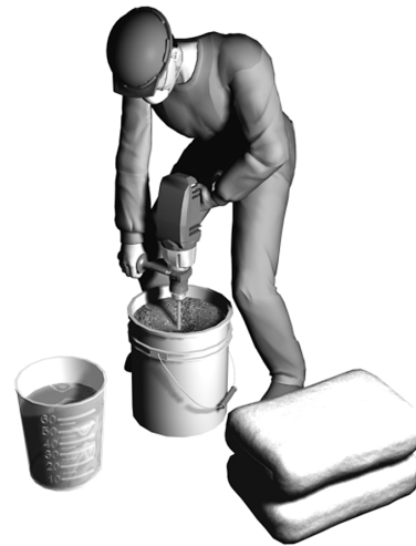
Fig. 7—Typical equipment to mix materials.