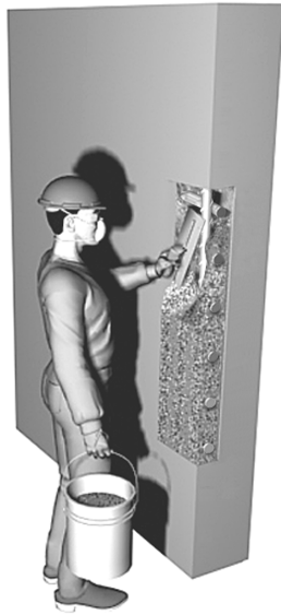
Fig. 8—Hand application of repair material.

encapsulation of the reinforcement is important for long-term durability; and