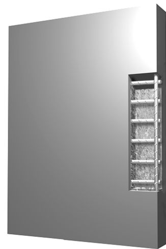
Fig. 5—Properly prepared surface.

cement-based materials designed for hand application may also include polymers, silica fume, shrinkage-compensating materials, and other additives for enhanced physical properties and improved handling.