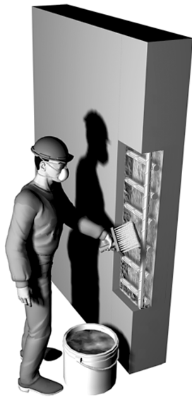
Fig. 6—Treatment of exposed reinforcement.

time (or maximum moisture content) with the sealer or coating manufacturer before application commences. For more information, consult ACI 515.1R, “Guide to Use of Waterproofing, Dampproofing, Protective, and Decorative Barrier Systems for Concrete.”