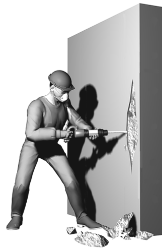
Fig. 2—Bulk concrete removal.

1. Bulk concrete removal and edge conditioning — Loose, delaminated concrete should be removed until the substrate consists of sound concrete (Fig. 2). Where corrosion of the reinforcement exists, continue bulk removal along the reinforcing steel and adjacent areas with evidence of corrosion-induced damage that would inhibit bonding of repair materials. Bulk concrete removal should include undercutting the corroded reinforcing steel by approximately 3/4 in. (19 mm). The shape of the prepared cavity should be kept as simple as possible—generally square or rectangular in shape. The edges of the patches should be sawcut perpendicular to the surface to a depth of 1/2 in. (13 mm) to avoid feather edging the repair material (Fig. 3).