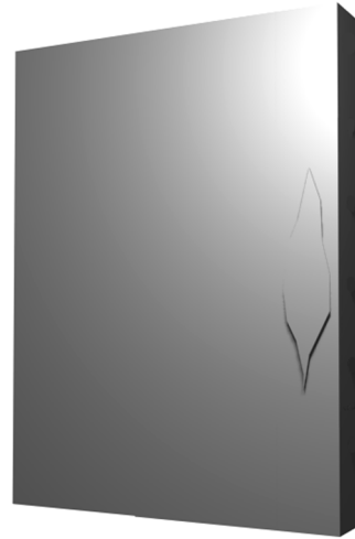
Fig. 1—Concrete delamination.

The recommended steps in properly preparing the surface to receive a hand-applied mortar are as follows: