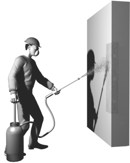
Fig. 9—Spray application of curing compound.