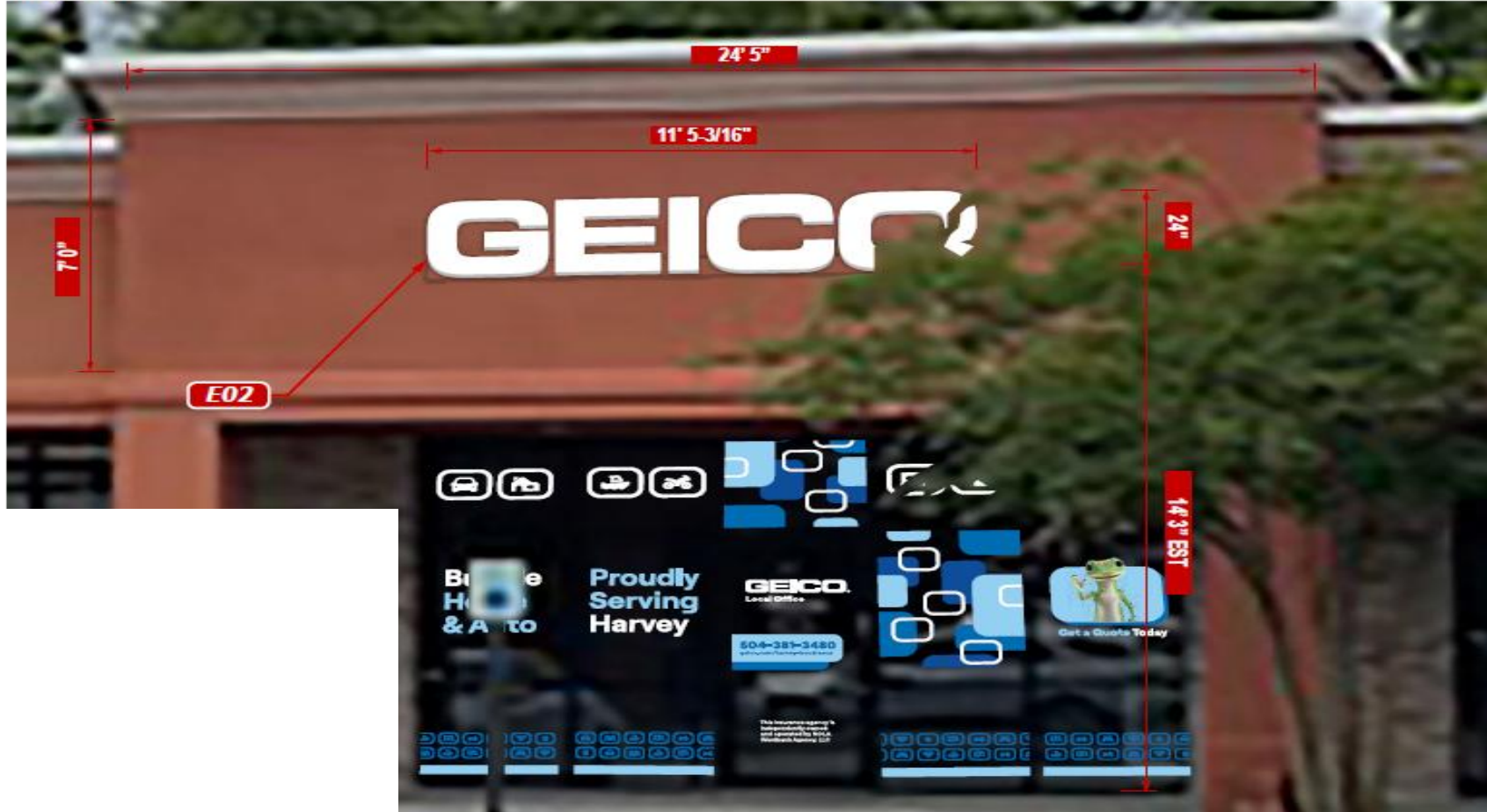
Signs Rendered Proportional to the Photo