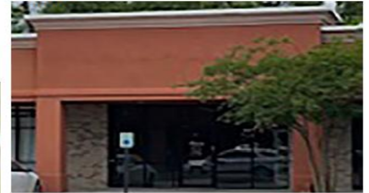
SIDE VIEW CROSS SECTION (NOT TO SCALE) NOT INTENDED FOR DETERMINING DIMENSIONS