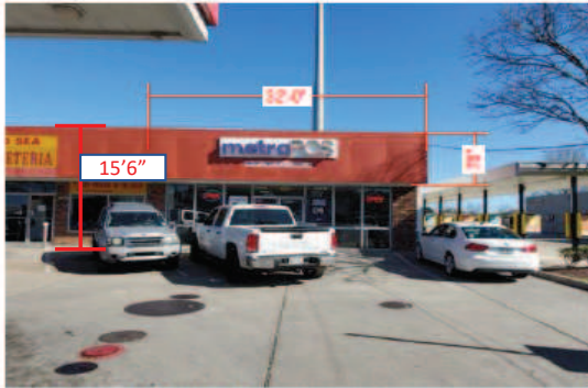
PHOTO SURVEY OF EXISTING