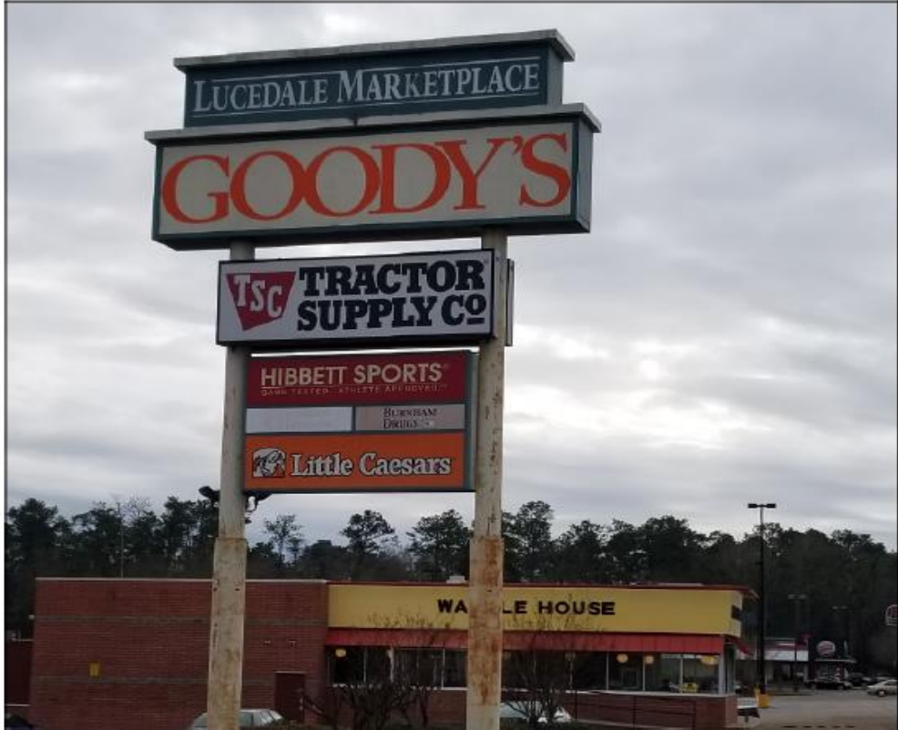
EXISTING Not to Scale