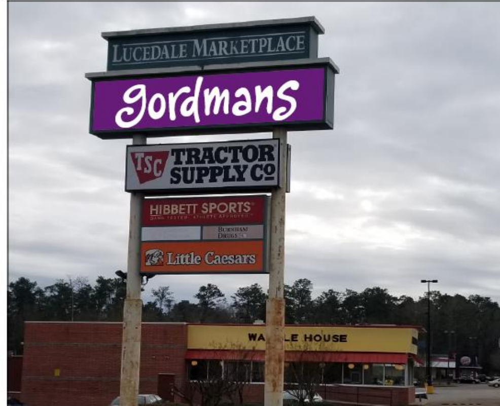
PROPOSED Not to Scale