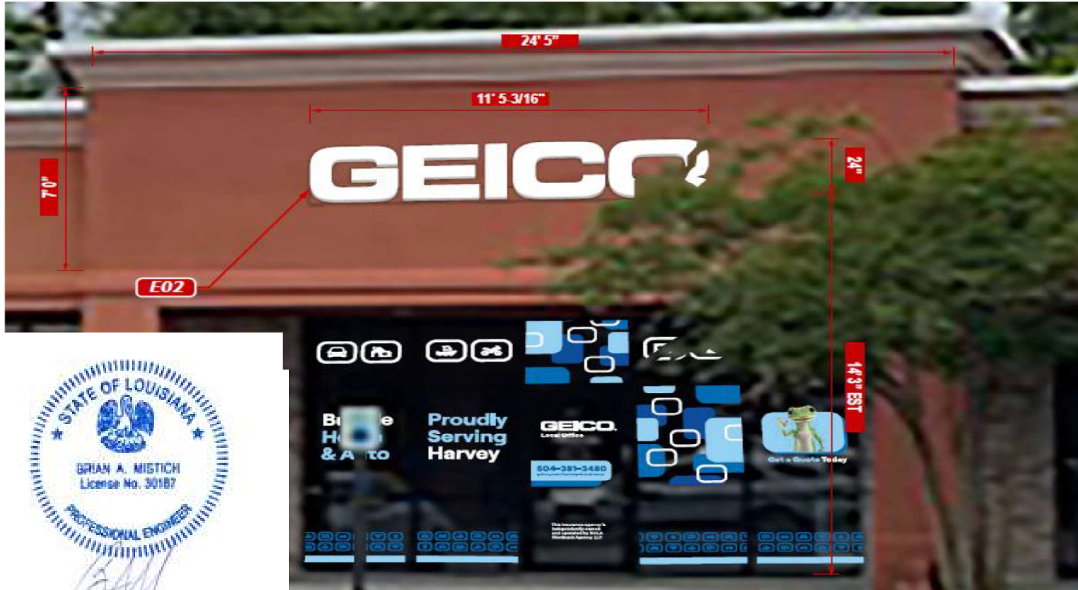
Signs Rendered Proportional to the Photo