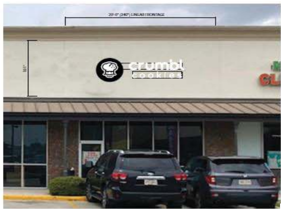
1.3 Front Elevation - South Scale: 1/8" = 1'-0"