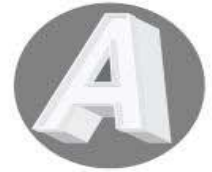
Channel Letter Color Reference

Details: LOGO ICON: 3" THICK FRONT LIT CHANNEL LETTER (PNT3) WITH VINYL OVERLAYS (VNL1) .080 THICK ALUMINUM BACKER (PNT1) 5/16" X 5/16" RACEWAY PAINTED SW 7568 (PNT4) 3/16" ACRYLIC FACE WHITE TRIM CAPS .040 ALUMINUM WHITE RETURNS | .063 ALUMINUM BACKS (PNT3) WHITE LEDS LETTERS: 3" THICK FRONT LIT CHANNEL LETTER (PNT3) 5/16" X 5/16" RACEWAY PAINTED SW 7568 (PNT4) 3/16" ACRYLIC FACE WHITE TRIM CAPS .040 ALUMINUM WHITE RETURNS | .063 ALUMINUM BACKS (PNT3) WHITE LEDS ALLOWED: 42" TOTAL HEIGHT SIGN SIZE: 42"H