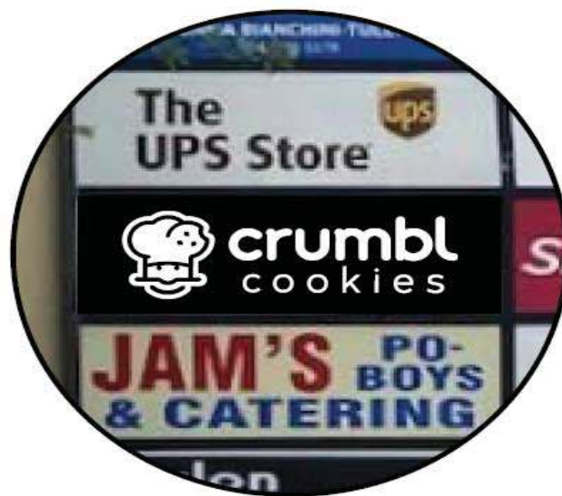
2.2 Pylon Photo Rendering (double-faced) Scale: NTS