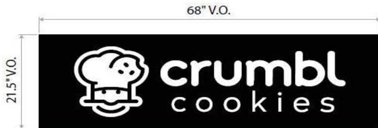
2.1 Pylon Panel Detail (double-faced) Scale: 1" = 1'-0"

Details : - Translucent white acrylic panels with vinyl overlay (VNL1)