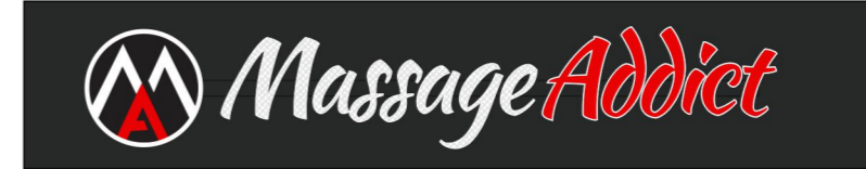
SIMULATED NIGHT VIEW