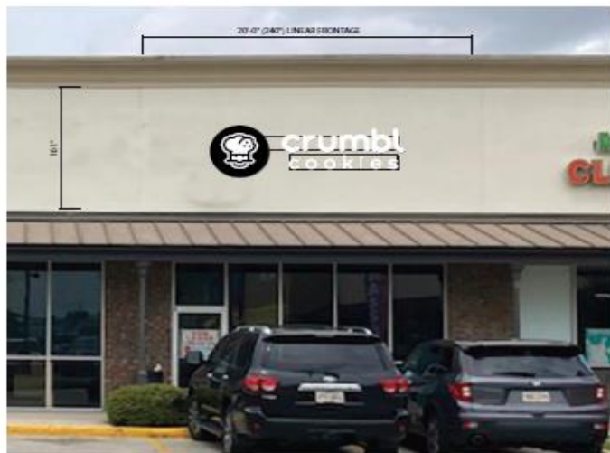
1.3 Front Elevation - South Scale : 1/8" = 1'-0"

All electrical components to be UL approved Customer is responsible for one (1) 120v/20a dedicated circuit with ground per sign within 6' of sign Lock out switch installed at panel box for all electrical signs Install in accordance with N.E.C. article 600 and/or local codes. This includes proper grounding and bonding of signs