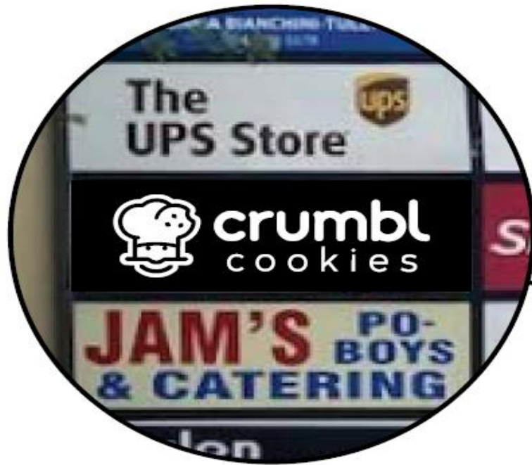
2.2 Pylon Photo Rendering (double-faced) Scale : NTS